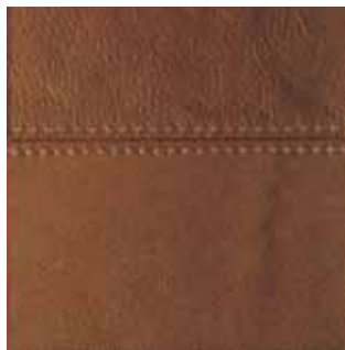
Differences in grain