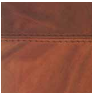
Differences in tone

Leather is a natural product and as such every piece of leather is unique. So when you own leather furniture, you truly own a one-of-a-kind original. You can tell your leather is authentic by its distinctive natural markings. In fact, the more evident the markings, the better the quality leather.